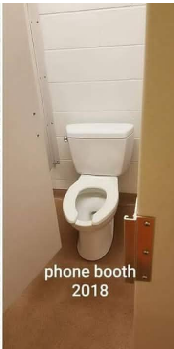
phone booth 2018

5 YR OLD DAUGHTER: MOM, WHY IS SOME OF YOUR HAIR WHITE?