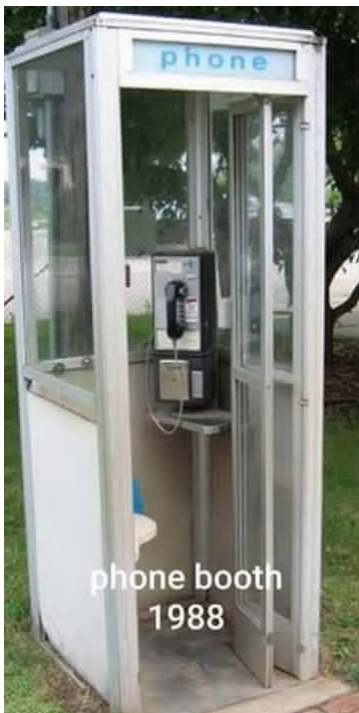
phone booth 1988